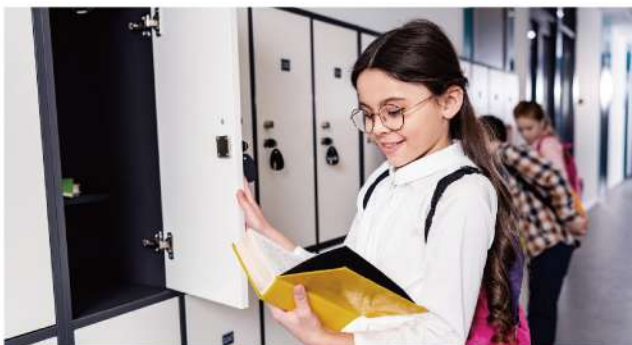
學校儲物櫃 School lockers