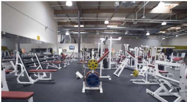
運動器材 Sports equipment

THE ANTIBACTERIAL POWDER COATINGS CAN BE APPLIED ON