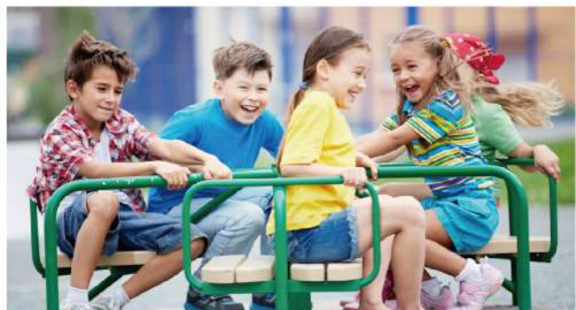
兒童遊樂設施 Children's entertainment facilities